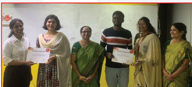
Hosted by Forbes Business School, Vijayawada