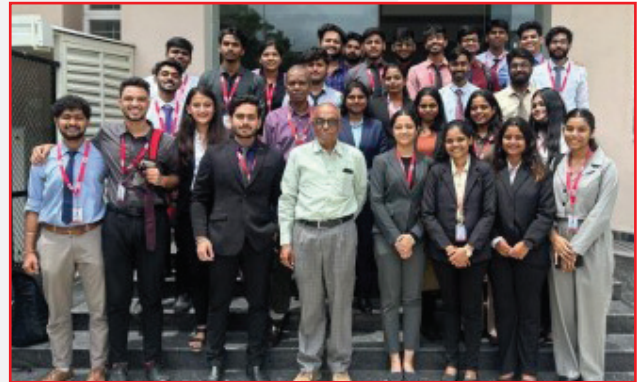
ELCITA Tech, Bangalore