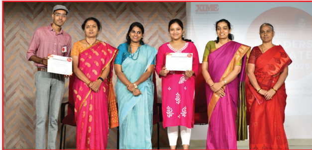
Hosted by Loyola Academy, Hyderabad