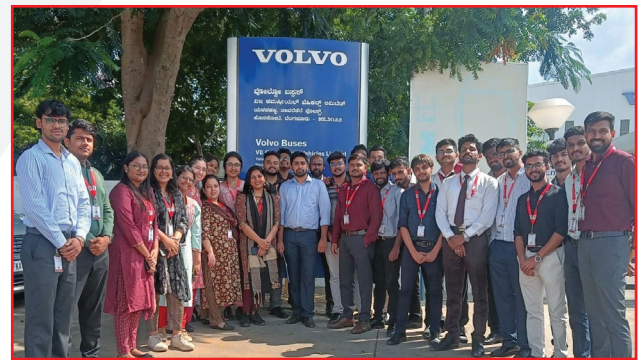
Volvo Bus Manufacturing