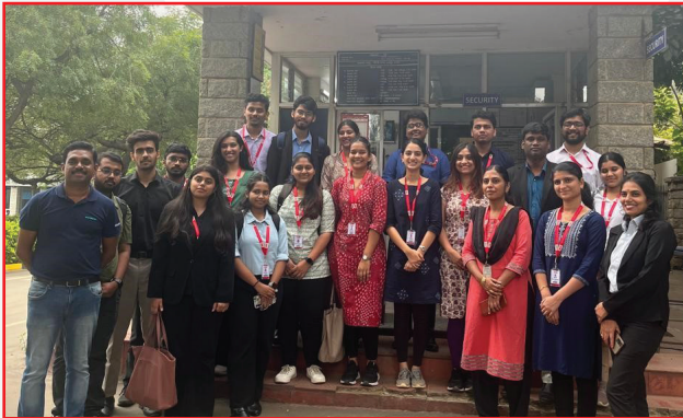
Sansera Engineering, Bangalore