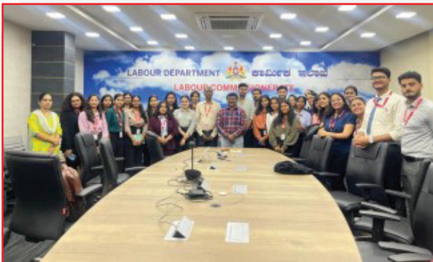
Labour Commissioner's Office, Bangalore