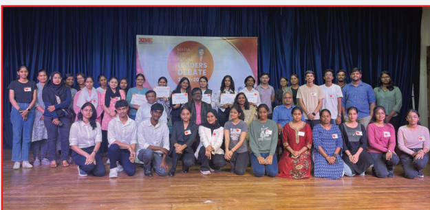
Hosted by De Paul College, Mysore