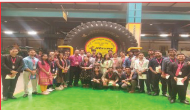
JK Tyres, Mysore