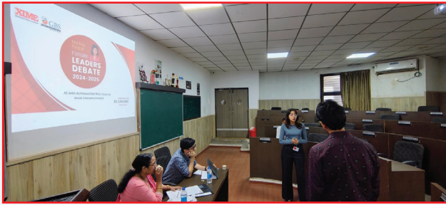
Hosted by Global Business School, Dharwad