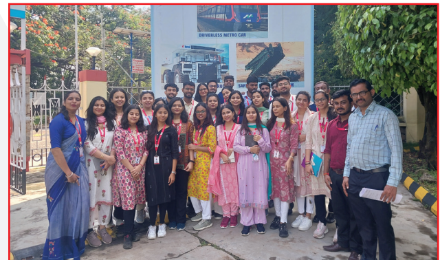
BEML Limited, Bangalore