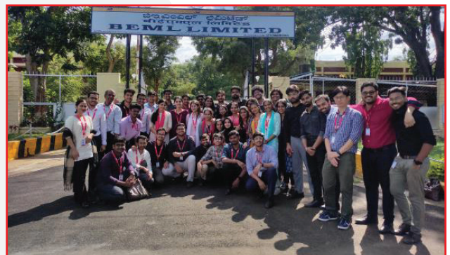
KGF, BEML Limited