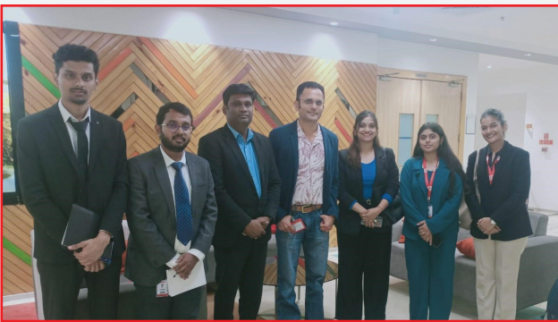
Reliance Trends, Bangalore