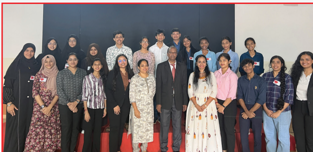
Hosted by St Aloysius, Mangalore